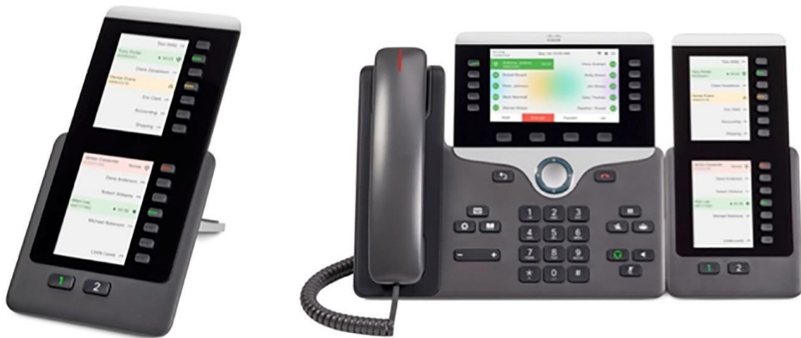
Figure 1. Cisco IP Phone 8851/61 Key Expansion Module

Quickly adapt to market changes. Increase productivity. Improve competitive advantage through speed and innovation. And deliver a rich-media experience across any workspace securely and with the best possible quality. Cisco® Unified Communications Solutions enable the collaboration that makes this possible (Figure 1).